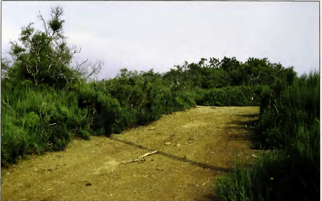
Fig. 16. Habitat of Menophra annegreteae sp. n. Cabo de Gata.

heavily sclerotised ostium ring, a very short ductus bursae (as long as wide), and an elongate, pear-shaped corpus bursae.